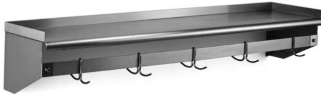
wall shelf with rack

Eagle Wall Shelf with Removable Hooks, model _____ . Shelf is constructed of 16 gauge type 304 stainless steel, with 1½" roll on front and 1½" upturn on rear and ends. 2" x ¾" type 304 stainless steel flat bar. Furnished with double-prong stainless steel removable hooks, one every 12".