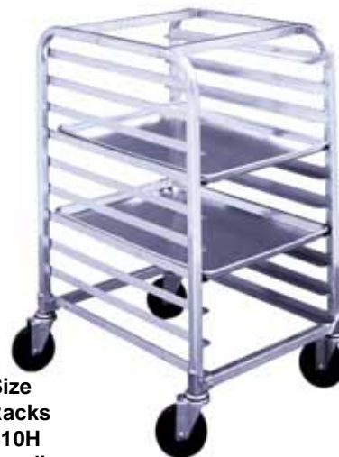
1/2" Size Pan Racks AL-1810H End Loading