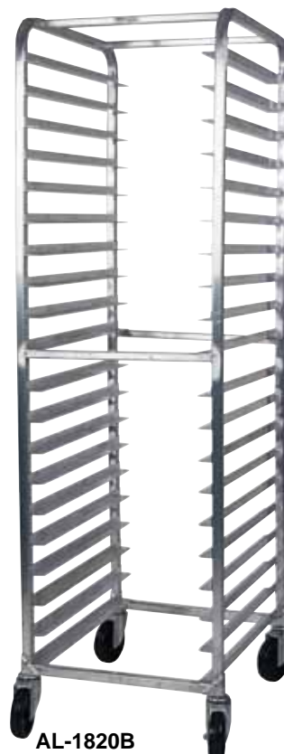
AL-1820B End Loading