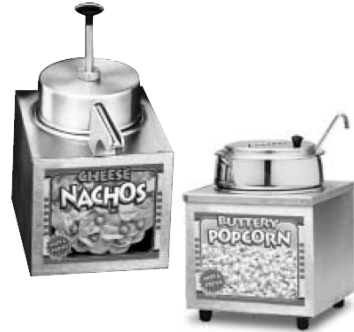
Model: Nacho Cheese Pump and Hot Butter Warmer