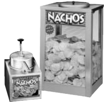
Nacho Cheese Pump with Nacho Cabinet