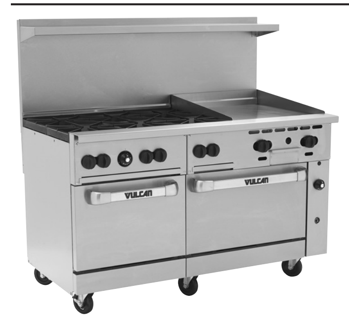
Model 60SS-6B24GN (shown with optional casters)