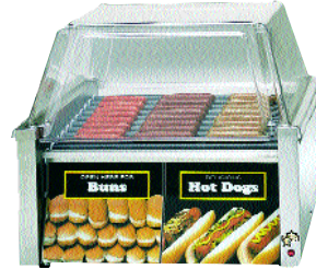
Model 30SCBD with Sneeze Guard