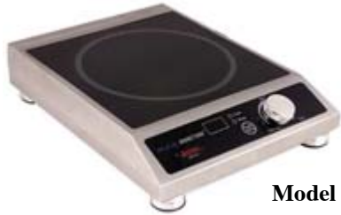
Model SM-181C Shown