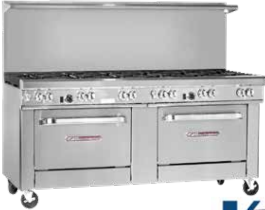
4721DD (shown with optional casters)

Configure your own custom spec sheet and model number at www.BuildMyRange.com . Refer to AutoQuotes for list pricing.