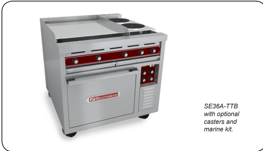
SE36A-TTB with optional casters and marine kit.