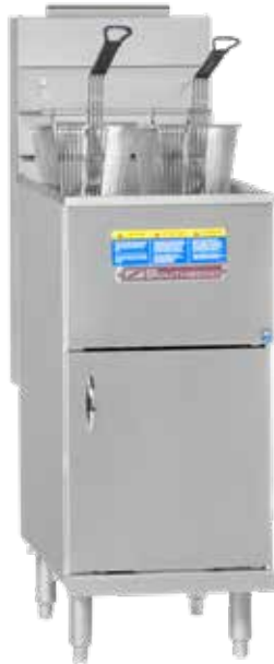
Model shown SB35S