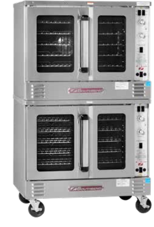
KLES/20SC shown with optional casters