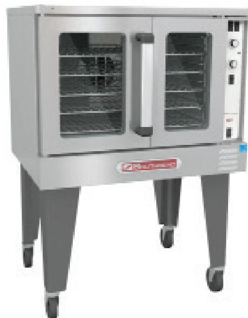
(BES/17SC shown with optional casters)