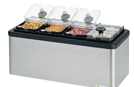
Mini Station Combos