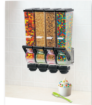
SLIMLINE™ DISPENSERS Model DFD