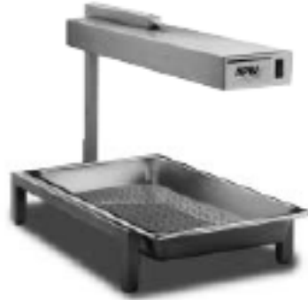
Model PD-1A Display Warmer