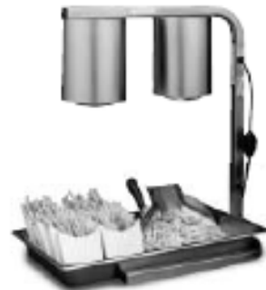
Model DW-1A Display Warmer