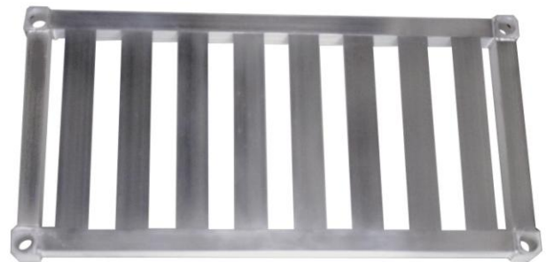
Adjust-A-Shelf – T-Bar Series