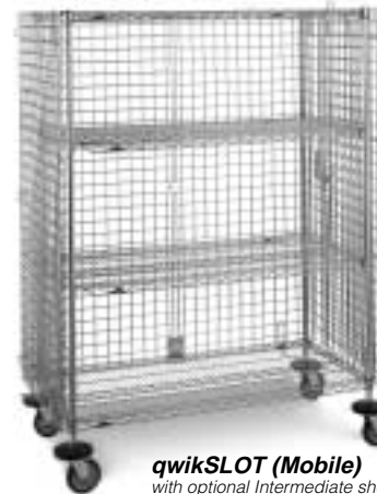
quwikSLOT (Mobile) with optional Intermediate shelves