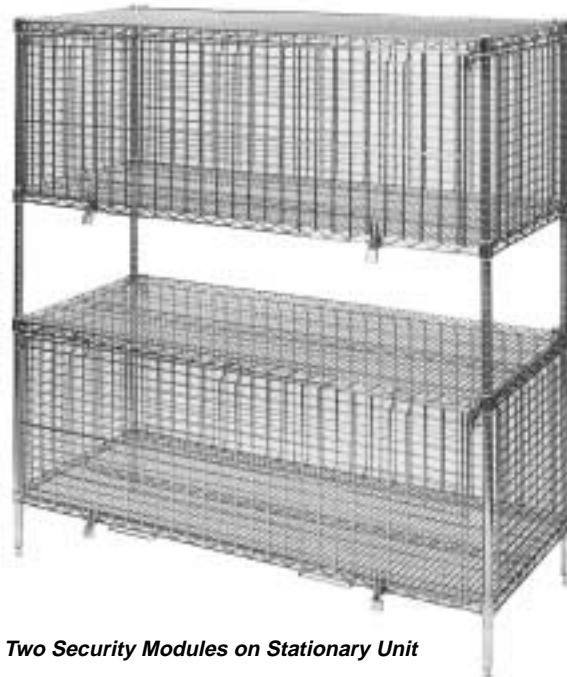
Two Security Modules on Stationary Unit