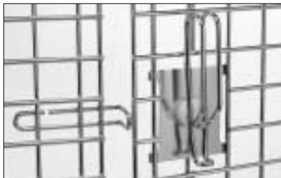
handle (open position)