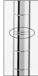
SiteSelect Posts feature double grooves every 8" (203mm) to aid assembly.