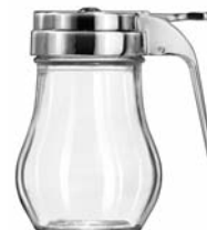
new Syrup Server w/Chrome Top No. L-206 6 oz./17.7 cl./177 ml. H4 1/8 T1 1/8 B2 D3 3/8 1 doz./6# • .36 cu.ft. SCC 344106 TRAEX TR-7C □