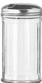
Sugar Pourer Stainless Steel Top No. 70141 12 oz./35.5 cl./355 ml. H5 3/4 T3 B3 D3 2 doz./20# • 1.00 cu.ft. SCC 112920 TRAEX TR-12HH □