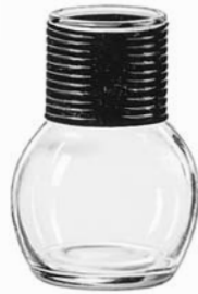
Server No. 5065 11½ oz./34.5 cl./345 ml. H4¾ T2½ B2¾ D3¼ 2 doz./8# • .94 cu.ft. SCC 171866 TRAEX TR-6B □