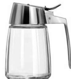
new Continental Syrup Server w/Chrome Top No. L-912 12 oz./35.5 cl./355 ml. H5 1/8 T2 B2 1/8 D4 3/4 1 doz./10# • .34 cu.ft. SCC 344120 TRAEX TR-12H □