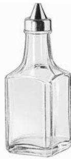
Oil and Vinegar Cruet Stainless Steel Top No. 75391 4 oz./11.8 cl./118 ml. H5½ T1½ B2½ D2⅞ 1 doz./7# • .24 cu.ft. SCC 039746 TRAEX TR-9EE □