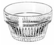
Ramekin No. 15447 + 5 oz./14.8 cl./148 ml. H2 T3½ B2¼ D3½ 3 doz./12# • .59 cu.ft. SCC 826995 TRAEX TR-16 □