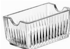
4¼" Sugar Package Holder No. 5460 H2½ T4¼ B3½ D4¼ 2 doz./16# • .47 cu.ft. SCC 846368 TRAEX TR-7C □