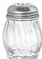
Cheese Shaker Stainless Steel Top No. 70132 5 3/4 oz./17.0 cl./170 ml. H3 5/8 T2 3/8 B2 1/8 D2 3/4 3 doz./13# • .83 cu.ft. SCC 093892 TRAEX TR-7A □

Libbey's tabletop accessories complement and complete your tabletop presentation.