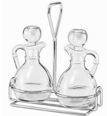
3-pc. Cruet Set No. 80371 H7½ T½ B7 D7 6 sets/shipper/13# • 1.95 cu.ft. SCC 849093