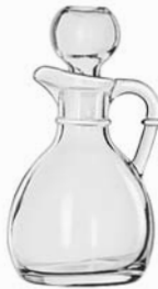
Cruet w/Stopper No. 75305 6 oz./17.7 cl./177 ml. H4½ T1½ B1¼ D2⅞ 1 doz./7# • .44 cu.ft. SCC 849086 TRAEX TR-7C □