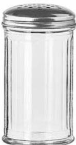
Cheese Shaker Stainless Steel Top No. 70140 12 oz./35.5 cl./355 ml. H5 3/4 T3 B3 D3 2 doz./20# • 1.00 cu.ft. SCC 112913 TRAEX TR-12HH □