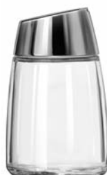
new Continental Slant Sugar Pourer w/Chrome Top No. L-930 12 oz./35.5 cl./355 ml. H5 1/8 T2 B2 1/8 D3 1/8 1 doz./14# • .23 cu.ft. SCC 344090 TRAEX TR-12H □