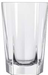
Beverage No. 15479 + 14 oz./41.4 cl./414 ml. H5¼ T3½ B2¾ D3½ 3 doz./40# • 1.63 cu.ft. SCC 485901 TRAEX TR-6BB □