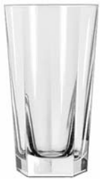
Hi-Ball No. 15485 + 9 oz./26.6 cl./266 ml. H5½ T2½ B2½ D2½ 3 doz./26# • 1.17 cu.ft. SCC 875542 TRAEX TR-12HH □