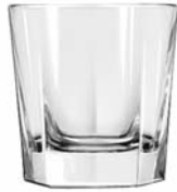
Rocks No. 15481 + 9 oz./26.6 cl./266 ml. H3½ T3¾ B3½ D3¾ 3 doz./35# • 1.07 cu.ft. SCC 831104 TRAEX TR-6B □