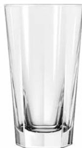
Cooler No. 15477 + 15¼ oz./45.1 cl./451 ml. H6½ T3½ B2½ D3½ 2 doz./29# • 1.31 cu.ft. SCC 063342 TRAEX TR-6BB □