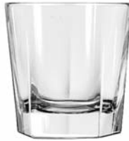
Double Old Fashioned No. 15482 + 12¼ oz./36.2 cl./362 ml. H3¾ T3¾ B3½ D3¾ 2 doz./28# • 1.01 cu.ft. SCC 366085 TRAEX TR-11G □