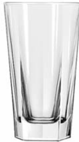
Beverage No. 15483 + 12 oz./35.5 cl./355 ml. H5¾ T3½ B2¾ D3½ 3 doz./35# • 1.46 cu.ft. SCC 831142 TRAEX TR-6BB □