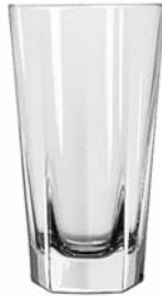
Beverage No. 15478 + 10 oz./29.6 cl./296 ml. H5¾ T3 B2½ D3 3 doz./33# • 1.31 cu.ft. SCC 485895 TRAEX TR-12HH □