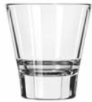
new Espresso No. 15733 + 3.7 oz./11 cl./110 ml. H3 T2¼ B1¼ D2¼ 1 doz./15# = .35 cu.ft. SCC 6943949906986 TRAEX TR-7 □