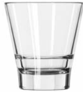
Rocks No. 15710 + 9 oz./26.6 cl./266 ml. H3¾ T3½ B2¼ D3½ 1 doz./8# = .45 cu.ft. SCC 367112 TRAEX TR-6B □