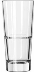
Beverage No. 15713 + 12 oz./35.5 cl./355 ml. H6¼ T3 B2¼ D3 1 doz./13# = .50 cu.ft. SCC 367143 TRAEX TR-12HH □