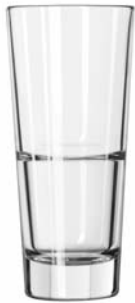
Hi-Ball No. 15711 + 10 oz./29.6 cl./296 ml. H6¼ T2¾ B2 D2¾ 1 doz./11# = .44 cu.ft. SCC 367136 TRAEX TR-7CC □