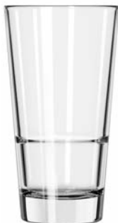
Stacking Pub Glass No. 15720 + 16½ oz./48.8 cl./488 ml. H6½ T3½ B2½ D3½ 1 doz./15# = .66 cu.ft. SCC 387684 TRAEX TR-6BBB □