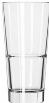
Cooler No. 15717 + 20 oz./59.2 cl./592 ml. H7¼ T3¾ B2¾ D3¾ 1 doz./19# = .85 cu.ft. SCC 378385 TRAEX TR-11GGG □