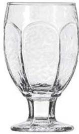
Banquet Goblet No. 3211 ■ 10½ oz./31.1 cl./311 ml. H5½ T2½ B2¼ D3¼ 2 doz./14# • .96 cu.ft. SCC 369970 TRAEX TR-12HH □