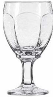
Goblet No. 3212 ■ 12 oz./35.5 cl./355 ml. H6½ T3¼ B3 D3½ 3 doz./30# • 2.16 cu.ft. SCC 716128 TRAEX TR-13BBBB □