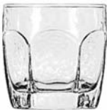
Rocks No. 2484 ● 8 oz./23.7 cl./237 ml. H3½ T3½ B2½ D3½ 3 doz./19# • .93 cu.ft. SCC 744671 TRAEX TR-12A □