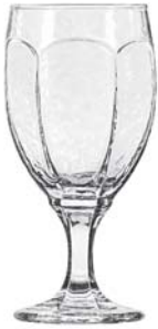
Wine No. 3264 ■ 8 oz./23.7 cl./237 ml. H6¼ T2½ B2½ D3 3 doz./20# • 1.46 cu.ft. SCC 717774 TRAEX TR-12HH □