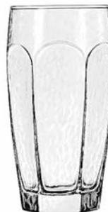
Cooler No. 2486 ● 16 oz./47.3 cl./473 ml. H6½ T3 B2¾ D3¼ 3 doz./28# • 1.68 cu.ft. SCC 753833 TRAEX TR-12HH □