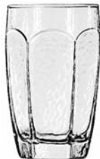
Beverage No. 2489 ● 10 oz./29.6 cl./296 ml. H4¾ T2¾ B2½ D3 3 doz./20# • 1.13 cu.ft. SCC 744688 TRAEX TR-12HA □