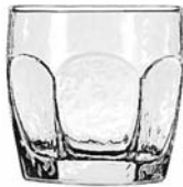
Rocks No. 2485 ● 10 oz./29.6 cl./296 ml. H3¾ T3¼ B2½ D3¾ 3 doz./24# • 1.12 cu.ft. SCC 753819 TRAEX TR-6A □