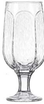
Beer No. 3228 ■ 12 oz./35.5 cl./355 ml. H7 T2½ B2¼ D3½ 3 doz./25# • 1.77 cu.ft. SCC 771684 TRAEX TR-12HHH □