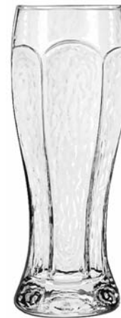
Giant Beer No. 2478 ● 22¾ oz./67.3 cl./673 ml. H9½ T3¼ B3½ D3¾ 1 doz./16# • .96 cu.ft. SCC 575978 TRAEX TR-6BBBB □