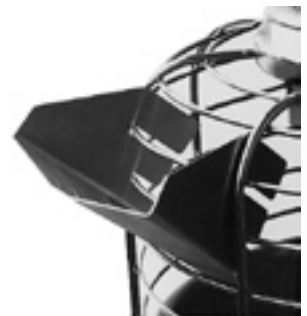
Hobart Ingredient Chute

Listed by Underwriters Laboratories Inc. and certified by NSF International.