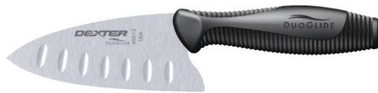
40013 5" Utility Knife

With a wide blade that enhances control, the DuoGlide 5" Utility Knife is perfect for small jobs that used to seem monumental. It's ideal for slicing, dicing, and chopping parsley, vegetables, fruit, and other ingredients.