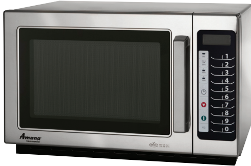
Model RCS10TS shown