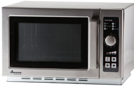
Model RCS10DSE shown