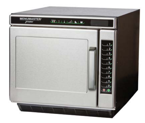
Model JET19V shown