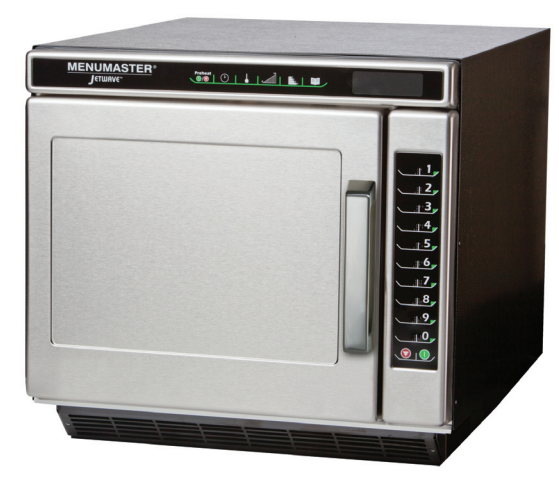
Model JET14V shown