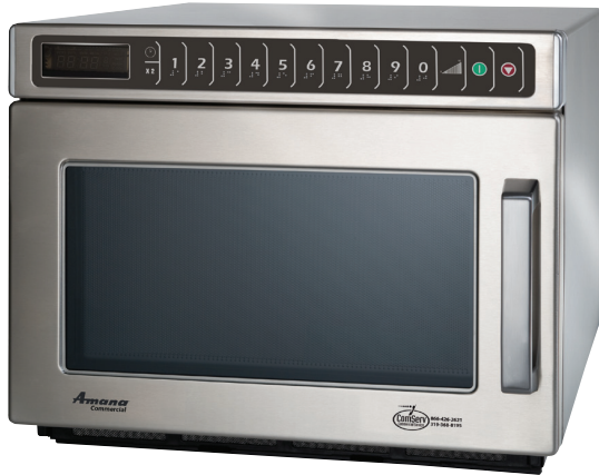
Model HDC212 shown