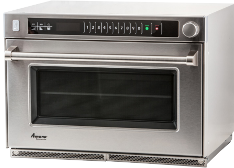
Model AMSO22 shown