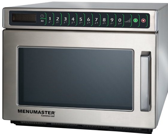
Model MDC212 shown