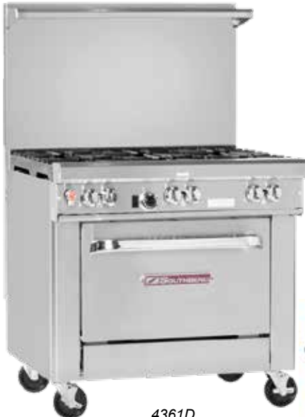
4361D (shown with optional casters)

Configure your own custom spec sheet and model number at www.BuildMyRange.com . Refer to AutoQuotes for list pricing.