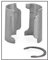
Aluminum Split Sleeve